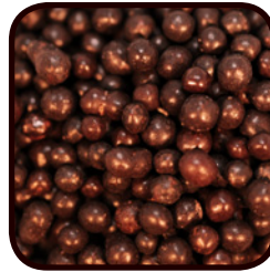
118586 PEARLS CRISPY MILK CHOCOLATE