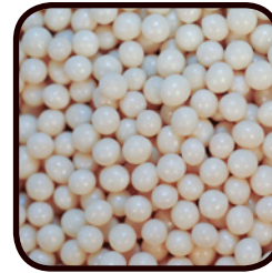
118587 PEARLS CRISPY WHITE CHOCOLATE