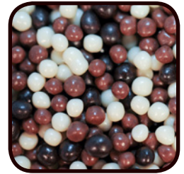
118588 PEARLS CRISPY DARK/ MILK/WHITE CHOCOLATE