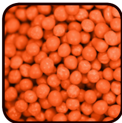
118589 PEARLS CRISPY ORANGE CHOCOLATE