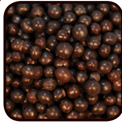
118585 PEARLS CRISPY DARK CHOCOLATE