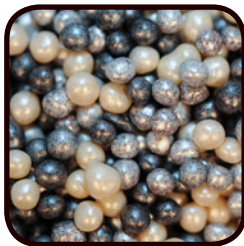
118622 PEARLS CRISPY SILVER CHOCOLATE