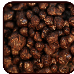
118624 GEMS DARK CHOCOLATE CANDIED ORANGE PEELED PIECES