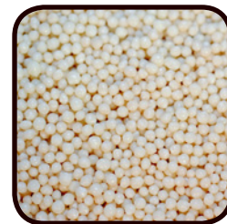
118619 CAVIAR CRISPY WHITE CHOCOLATE