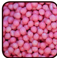
118620 PEARLS CRISPY STRAWBERRY CHOCOLATE