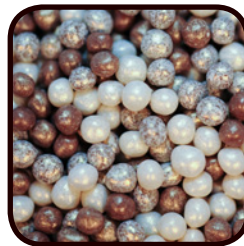
118621 PEARLS CRISPY GOLD CHOCOLATE