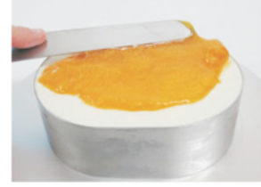
Gently spread Glitter Mirror Glaze by using a spatula