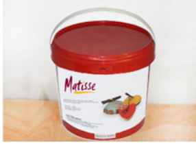
Glitter Mirror Glaze in a 7 kg plastic pail