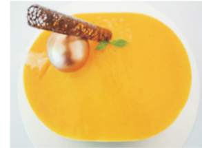
Garnish the cake