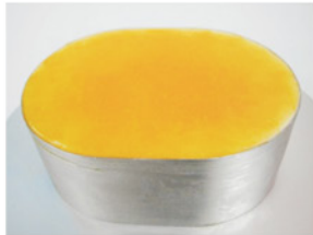
Evenly flatten onto the surface