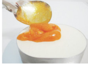
Scoop Glitter Mirror Glaze straight from the pail onto the chilled cake