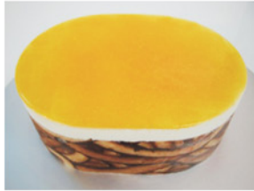
Remove cake ring from chilled glazed cake